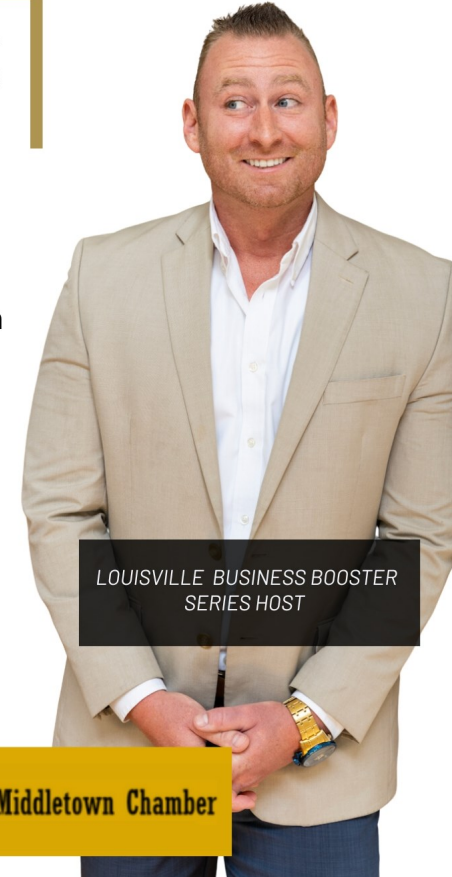
LOUISVILLE BUSINESS BOOSTER SERIES HOST