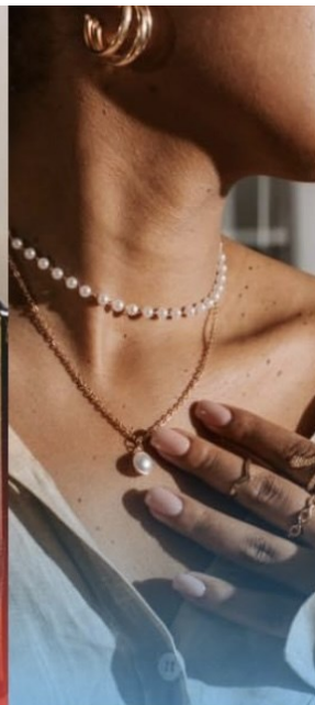
Fashion & Jewelry