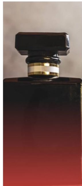
Products & Services