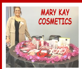
MARY KAY COSMETICS